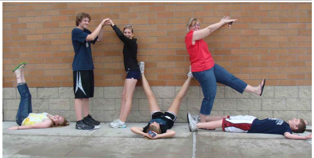
Having a blast on the Digital Scavenger Hunt