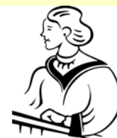
Associate Pastor's Message

This summer may you understand that life with Jesus is meant to be a life of abundance!